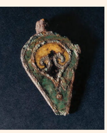
Cramond Roman enamelled seal-box

This conference will bring together professional and academic archaeologists, members of the public and those engaged in the management and interpretation of Cramond to explore these questions and many more. It is hoped that the conference will aid in the development of an Archaeological Research Agenda, building upon the 2003 CEC Historic Cramond Management Plan & SCARF, to encourage greater engagement, focus future research, innovation and aid in the management of the site.